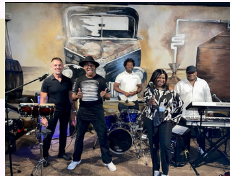
Band Unique Full Circle